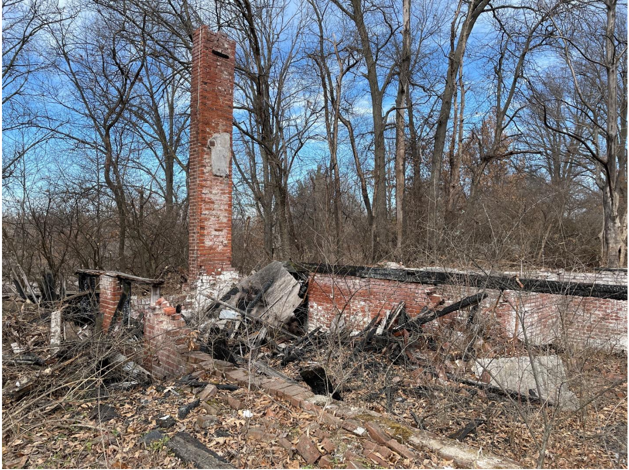
6900 N. Market, Wellston, MO