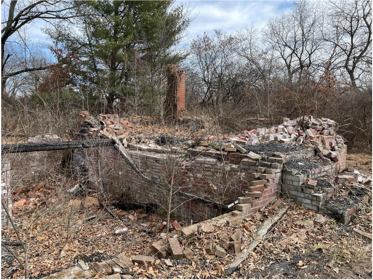
6900 N. Market, Wellston, MO